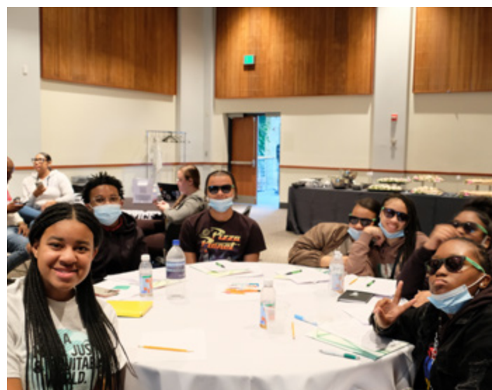
Cristo Rey Visitation Day

16 volunteers for 144 hours total over six-weeks.