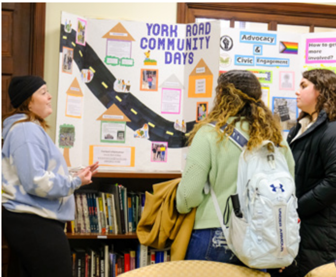
CCSJ Open House

Nearly 1,100 service hours in total amongst the 40 awardees.