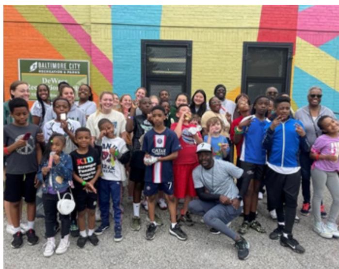
Spring Sports Clinic for local youth at Dewees Recreation Center