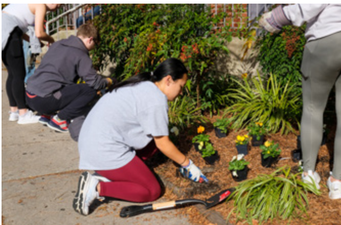
York Road Community Days

Refugee Youth Project Super Store (Catholic Charities) Walter P. Carter Elementary/ Middle School Nexus-Woodbourne Family Healing