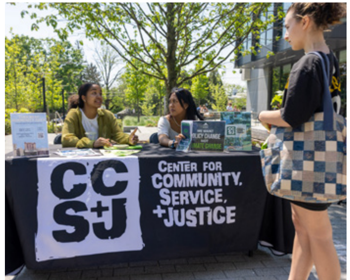
CCSJ table during Earth Week