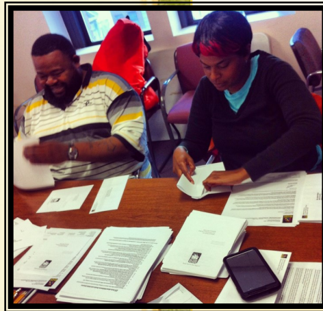
Baltimore Reads Volunteers